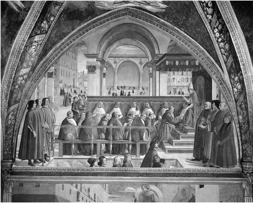
FIGURE 1. Domenico Ghirlandaio, The Confirmation of the Rule of Saint Francis, ca. 1479–85. Florence, Santa Trinita.